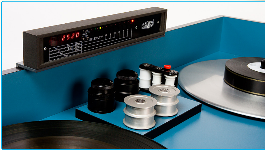
Overview with counter accessories