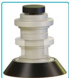
Special multi format guide roller